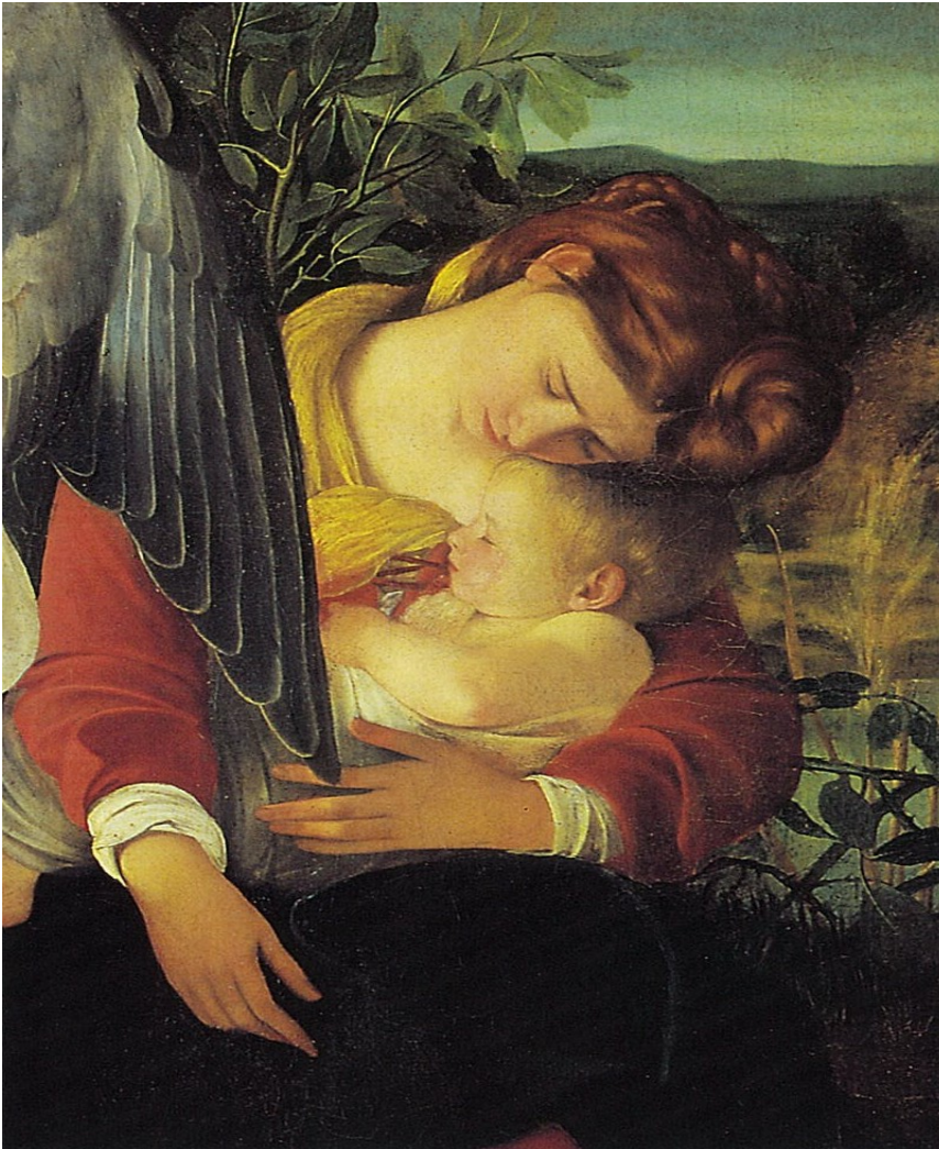
Details of 'The Flight into Egypt' by Caravaggio