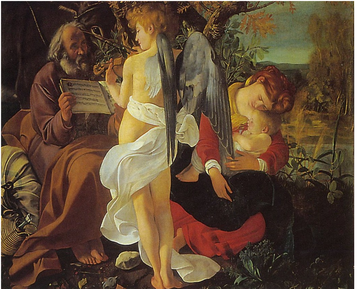
'The Flight Into Egypt' by Caravaggio