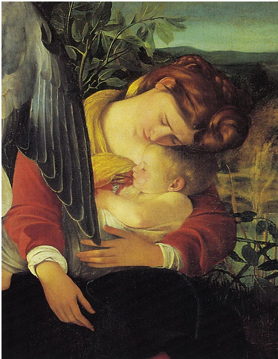
Detail of ' The Flight into Egypt ' by Caravaggio