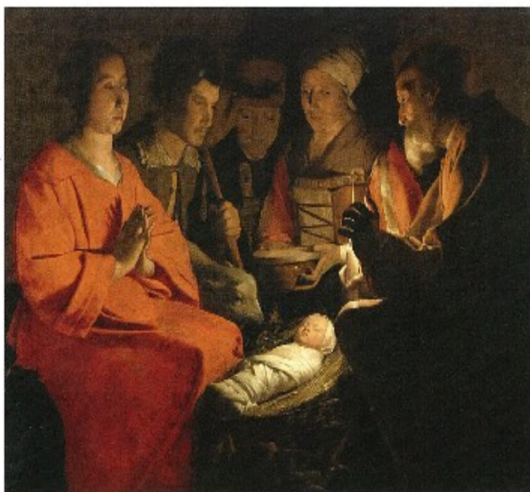
'The Adoration of the Shepherds' by Georges de La Tour

Post Christmas timetables available in the foyer and on our website