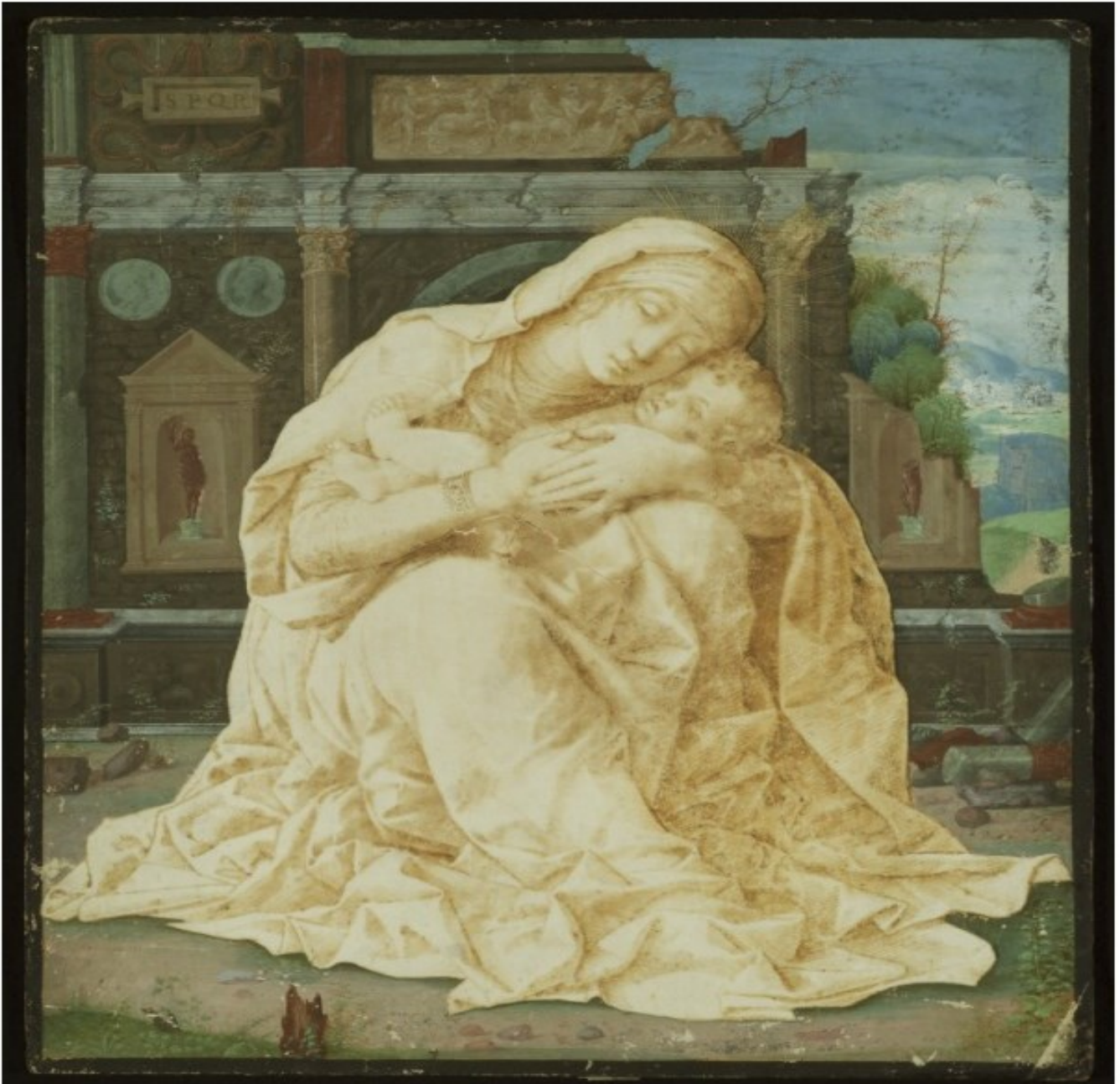
Madonna of Tenderness - Andrea Montegna Galleria d'Arte, Padua